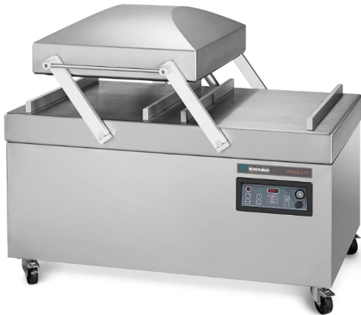
Optional without extra costs: 2 seal bars (left-right)